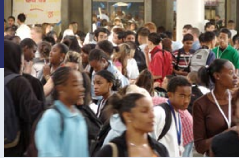
Overcrowding has reached severe levels at 5 of our 8 local high schools.